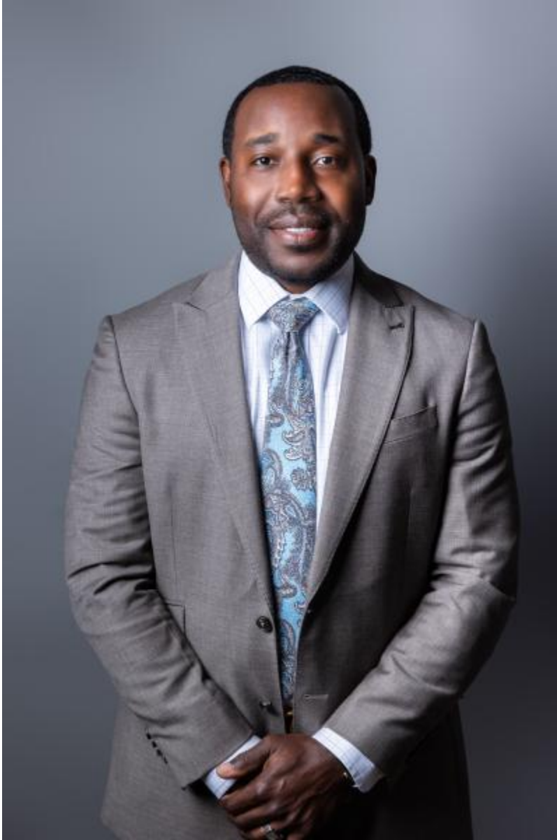
Mayor Corey Williams

Greensboro Municipal Building 212 N Main St Greensboro GA 30642-1110